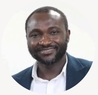
Henry Musa Kapka* Minister of Agriculture and Food Security, Sierra Leone