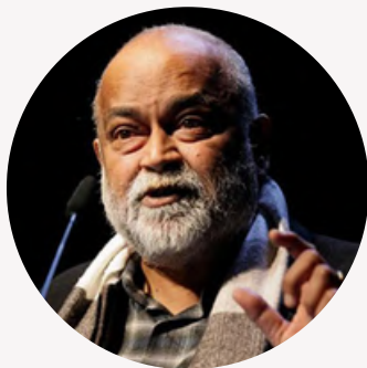
Arjun Appadurai Emeritus Professor of Media, Culture and Communication at New York University