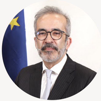
Paulo Rangel Minister of State and Foreign Affairs, Portugal