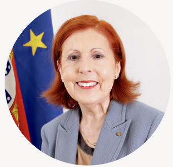
Maria da Graça Carvalho Minister of Environment and Energy, Portugal