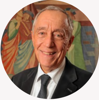
Marcelo Rebelo de Sousa* President of The Republic, Portugal