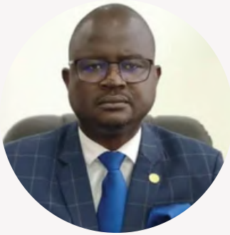
Viriato Cassama* Minister of Environment and Biodiversity, Guinea-Bissau