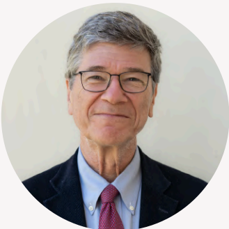
Jeffrey D. Sachs President of the UN Sustainable Development Solutions Network